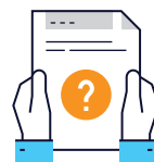
COMPLIANCE ON DEMAND Page 4