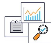
CONCLUSION Page 5