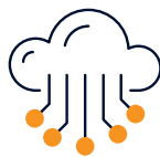
APPLICATIONS Page 3