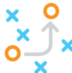
STRATEGY Page 5