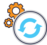
EXECUTION Page 6